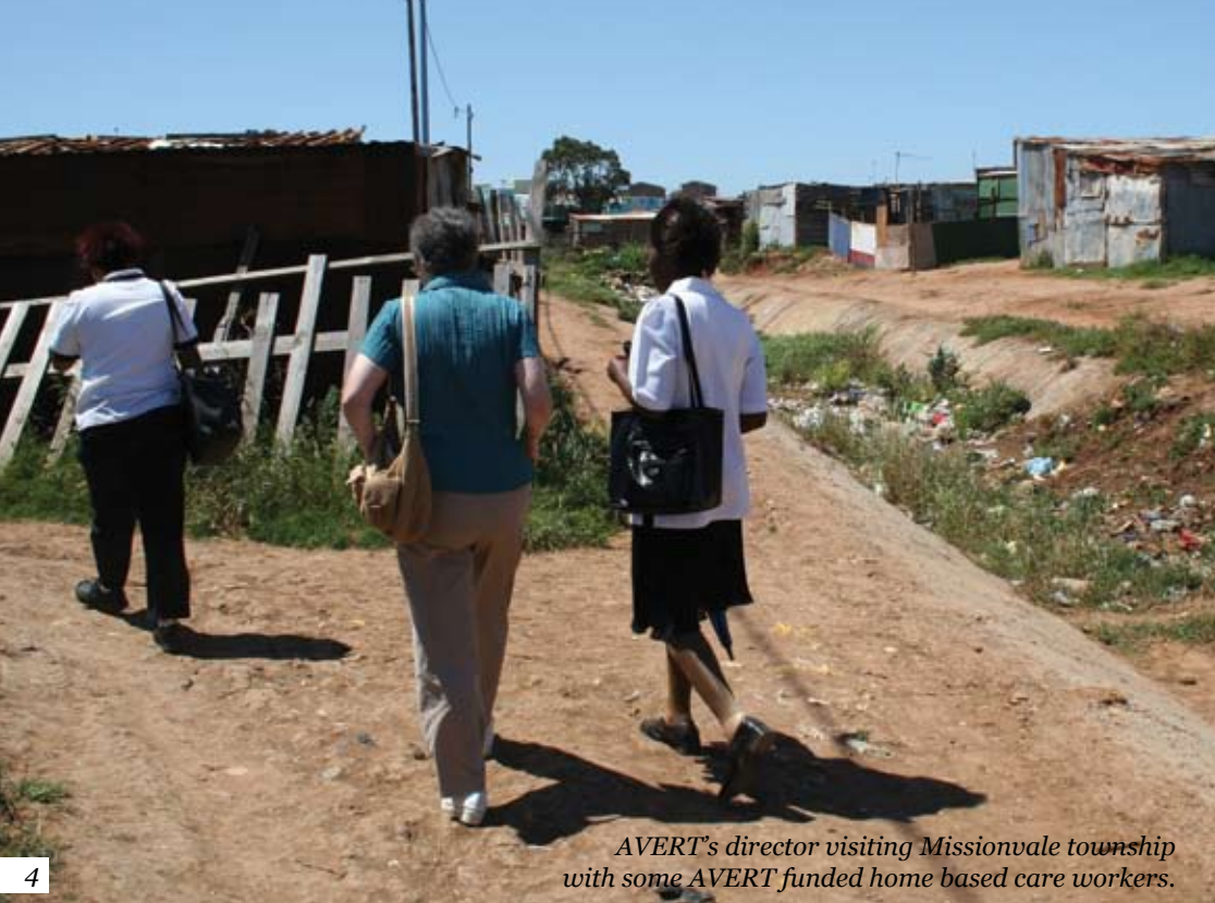
AVERT's director visiting Missionvale township with some AVERT funded home based care workers.

All the projects are carefully monitored, and visited regularly to ensure that the money that you provide is spent as effectively and as efficiently as possible. Project administration costs are kept as low as possible, in order that the maximum possible help goes to those in need.