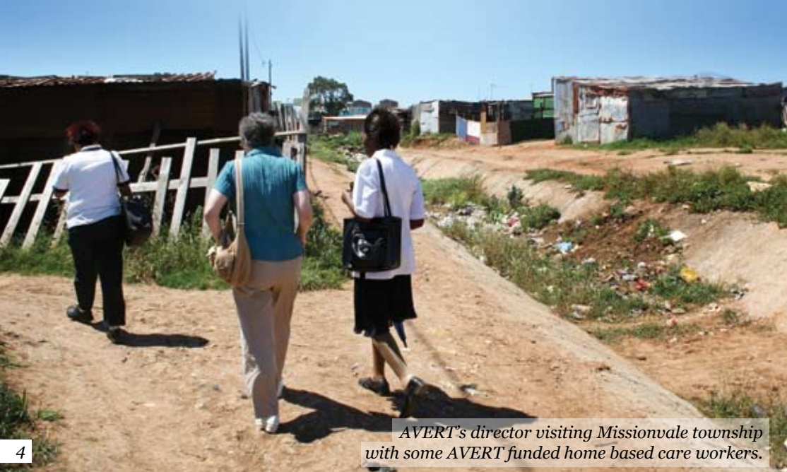
AVERT's director visiting Missionvale township with some AVERT funded home based care workers.

Another of AVERT's long-running projects is Tholulwazi. This project serves a rural area in the South African province of KwaZulu Natal. This area has a very high HIV infection rate and an estimated 3,000 orphans. AVERT's funding helps in a variety of ways including assistance with obtaining government grants, provision of emergency food and school help for the neediest children.